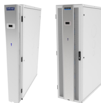
Integrated precision cooling